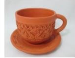
Kop Sansar ڪوپ سانسر